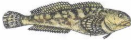
Blenny up to 15 cm.