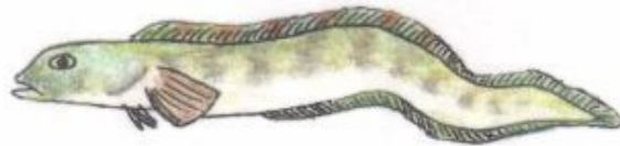
Eelpout up to 40 cm.